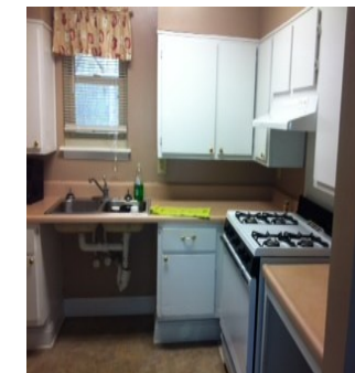
Left: Before Right: After

Please take care of your appliances. Make sure to clean them properly. If you need assistance, please contact the office and someone will direct you with cleaning instructions.